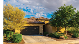
4945 S ARROYO LN $393,500