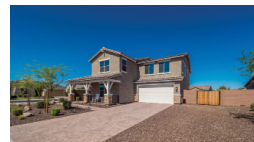
4996 S FOREST AVE $595,000