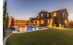
4849 S JOSHUA TREE LN $495,000