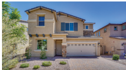
3447 E AZALEA DR $354,000