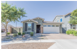
5006 S BRIDAL VAIL DR $355,000