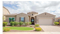
4917 S SOBOBA ST $515,000