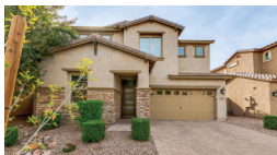
3443 E INDIGO ST $358,000