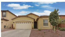
3939 E BLUE SPRUCE LN $368,500