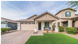
4974 S BRIDAL VAIL DR $325,000