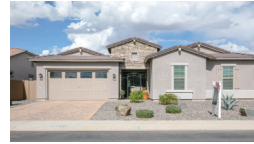
3636 E CASSIA LN $445,000