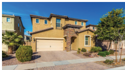
3468 E APPLEBY DR $352,000